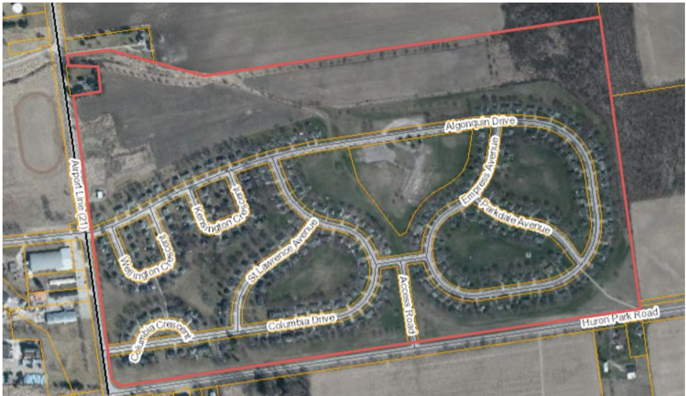
Figure 1. 2020 Air Photo of Subject Lands (outlined in red)

The request for draft plan approval extension was circulated to the Municipality of South Huron. Staff have no objections or concerns, and have provided a letter of support for the extension.